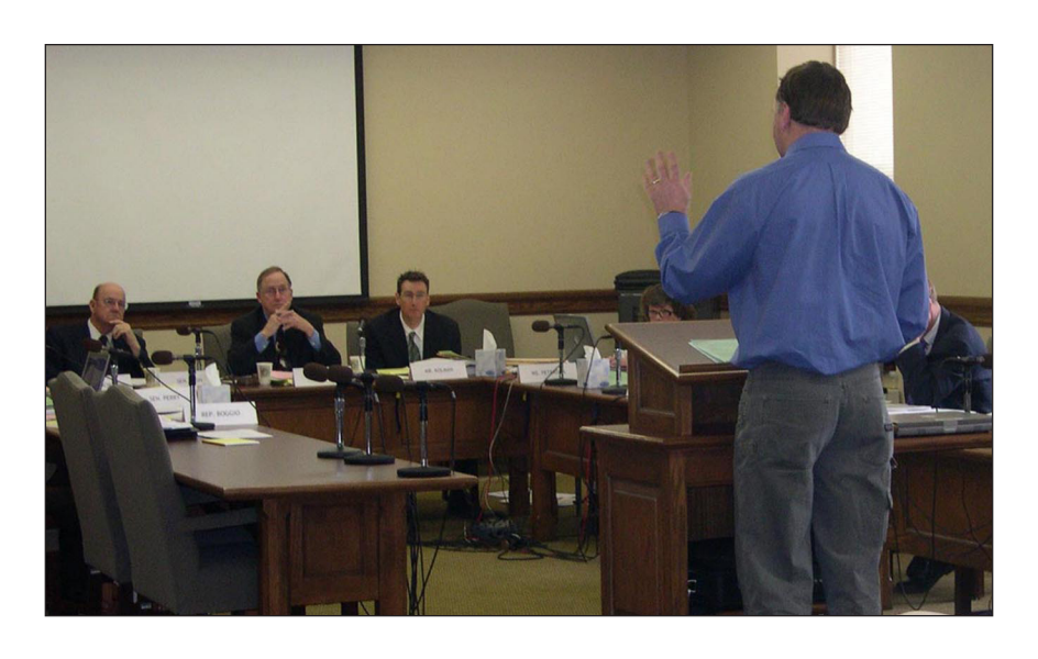
Committee hearings play a key role in the legislative process. They offer citizens a forum for expressing their opinions about legislation. They also provide an opportunity to watch representative democracy in action.

Should there be limits on how many bills a legislator can introduce? Why or why not?