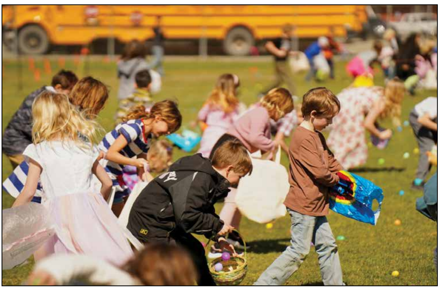
Children dash after eggs on the LCHS football field in Eureka at the March 31 Easter Egg hunt.