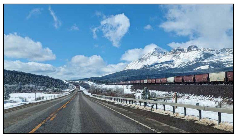
Bright blue skies gleam beyond freshly snow-capped peaks between East Glacier and Marias Pass on March 30.